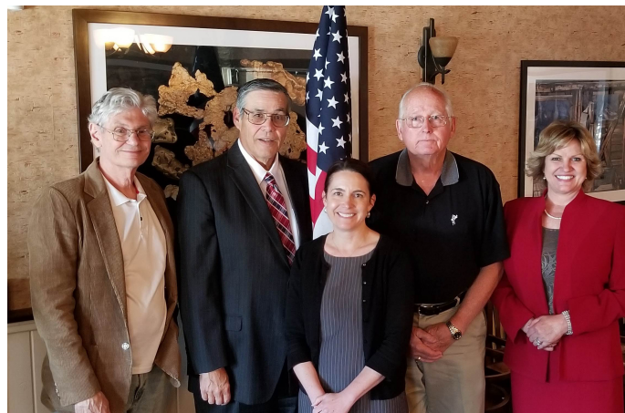
MCBA Officers and guest Judges